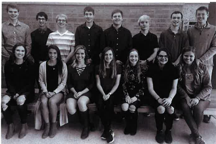
Illinois State Scholars 2018-2019